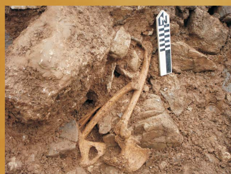
Pelvis and leg bones of the female skeleton found in the ditch fill