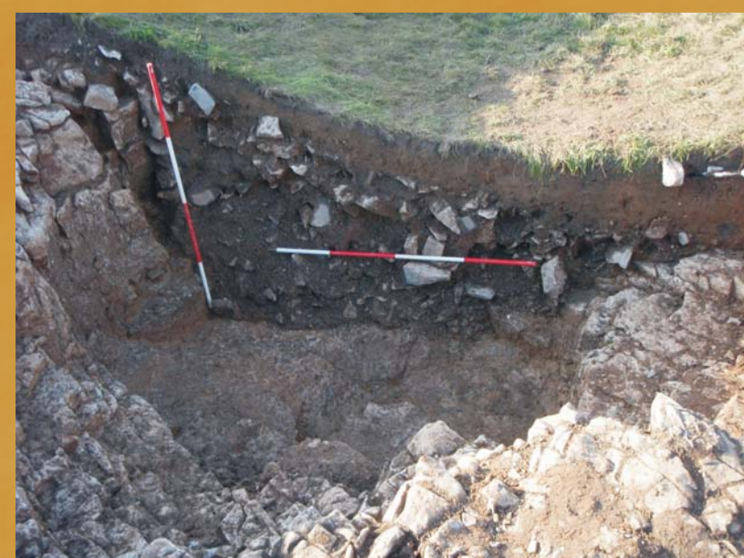
Section across the ditch fill which contained remains of the collapsed wall