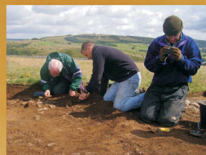
Recording pottery fragments within the hillfort