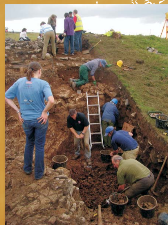
Volunteers excavating the rock cut ditch