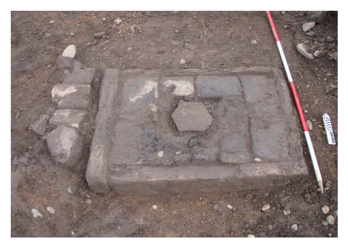
Figure 4 Hearth feature 006 illustrating its fine construction.

Within the footprint of the structure, a circular cut feature was tentatively identified (020) but upon excavation was demonstrated to be very shallow and devoid of artefactual material. It is unclear whether this feature was anthropogenic or merely represented compacted topsoil within a natural undulation in the sand and gravel substratum.