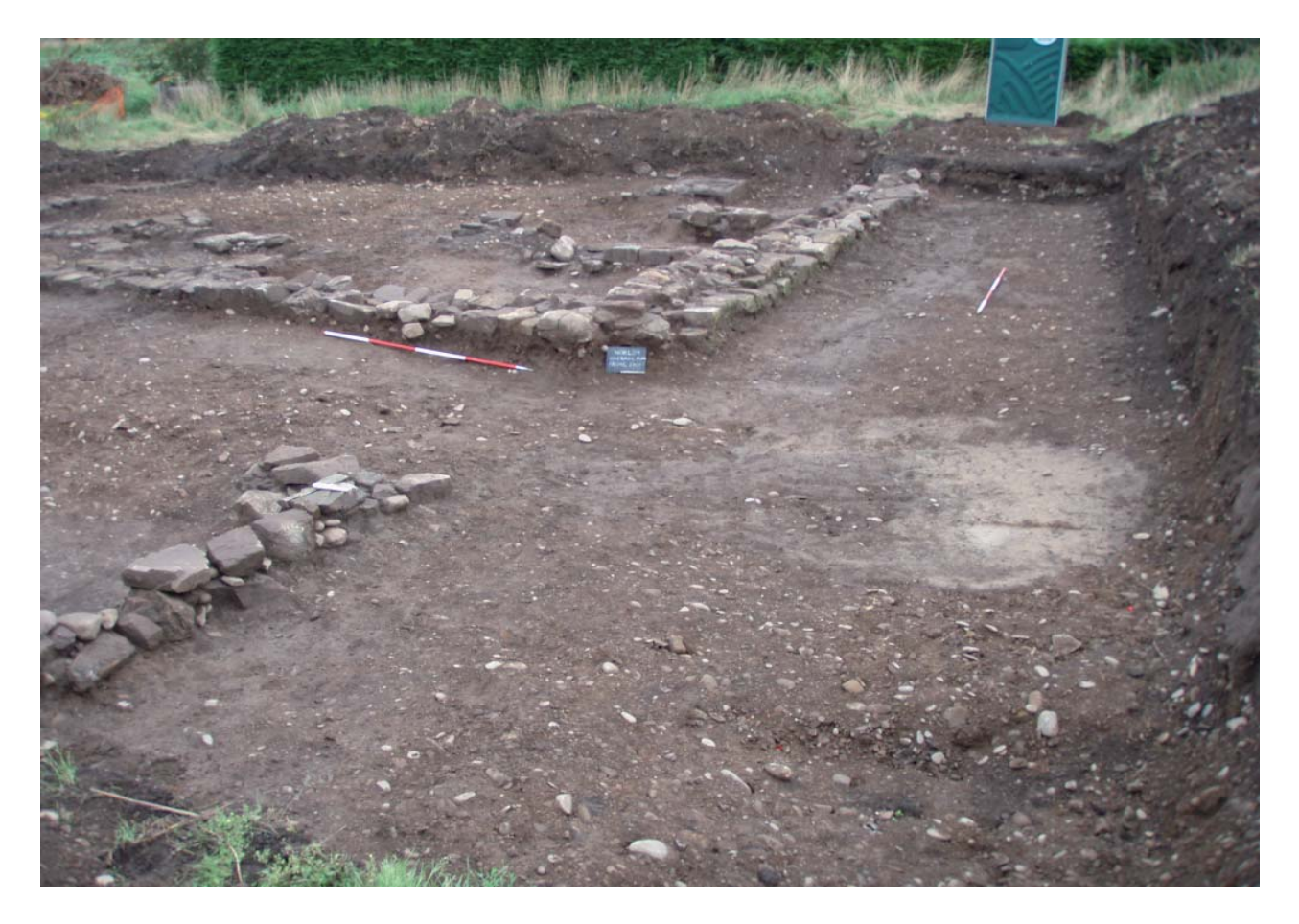
Figure 3 General view of the trench looking north-east illustrating the robust main wall footings.

bonded with what appeared to be a loose clay bond. The blocks surrounding the well were approximately 0.3 m wide and 0.4 m in length, with the interior diameter of the well 0.85 m, and the exterior diameter including the construction cut approximately 1.45 m. The fill of the well, which was excavated to a depth of 0.9 m, consisted of mixed and relatively loose topsoil and stones. The sandstone construction was removed to a depth of 0.5 m. Attempts were made to take core samples from the well but the high quantity of stones within made it impossible to penetrate more than 0.30 m.