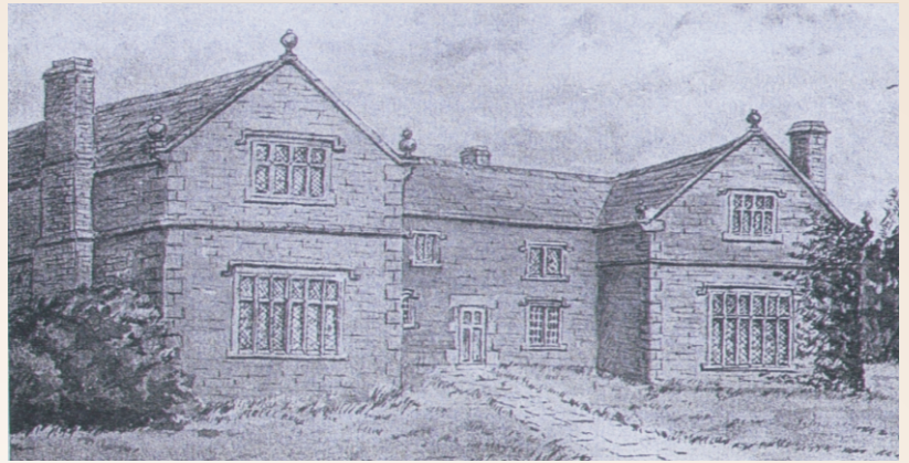
Pencil drawing of the Elizabethan hall demolished in 1852.

Artist's impression of what the cruck barn may have looked like prior to it being infilled with stone.