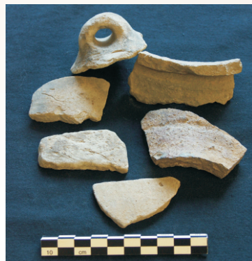
Volunteers excavating the Roman supply centre and some of the pottery discovered.