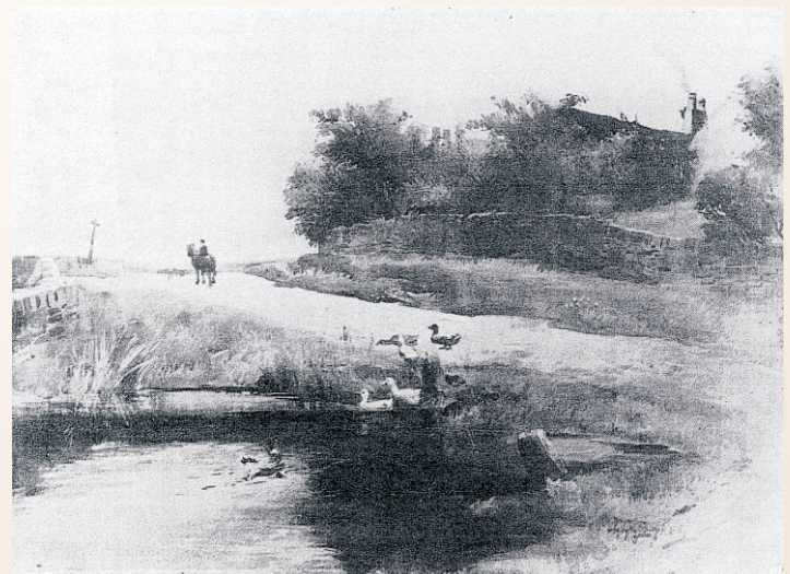
Two images of Whirlow Green and the ponds that were located on the bend of Broad Elms Lane in what is now the car park.